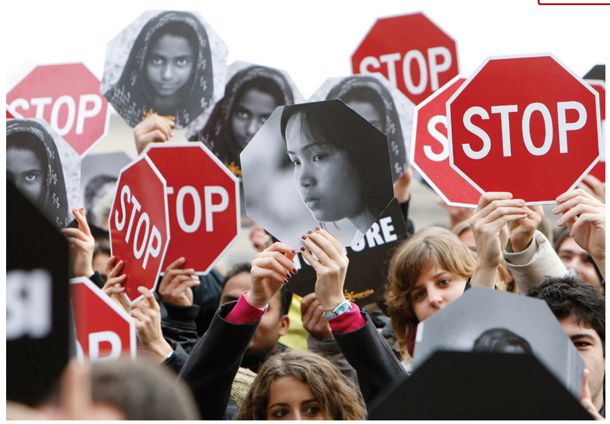
Figure 4.2: Women holding portraits of victims protest violence against women in Milan, Italy.

International research, conducted over the past two decades by the World Health Organization and others, reveals that violence against women is a much more serious and common problem than previously suspected. It is estimated that one out of three women worldwide has been raped, beaten or abused. While violence against women occurs in all cultures and societies, its frequency varies across countries. Societies that stress the importance of traditional patriarchal practices which reinforce unequal power relations between men and women and keep women in a subordinate position tend to have higher rates of violence against women. Rates tend to be higher in societies in which women are socially regulated or secluded in the home, excluded from participation in the economic labor market and restricted from owning and inheriting property. It is more prevalent where there are restrictive divorce laws, a lack of victim support services and no legislation that effectively protects female victims and punishes offenders. Violence against women is a consequence of gender inequality, and it prevents women from fully advancing in society.