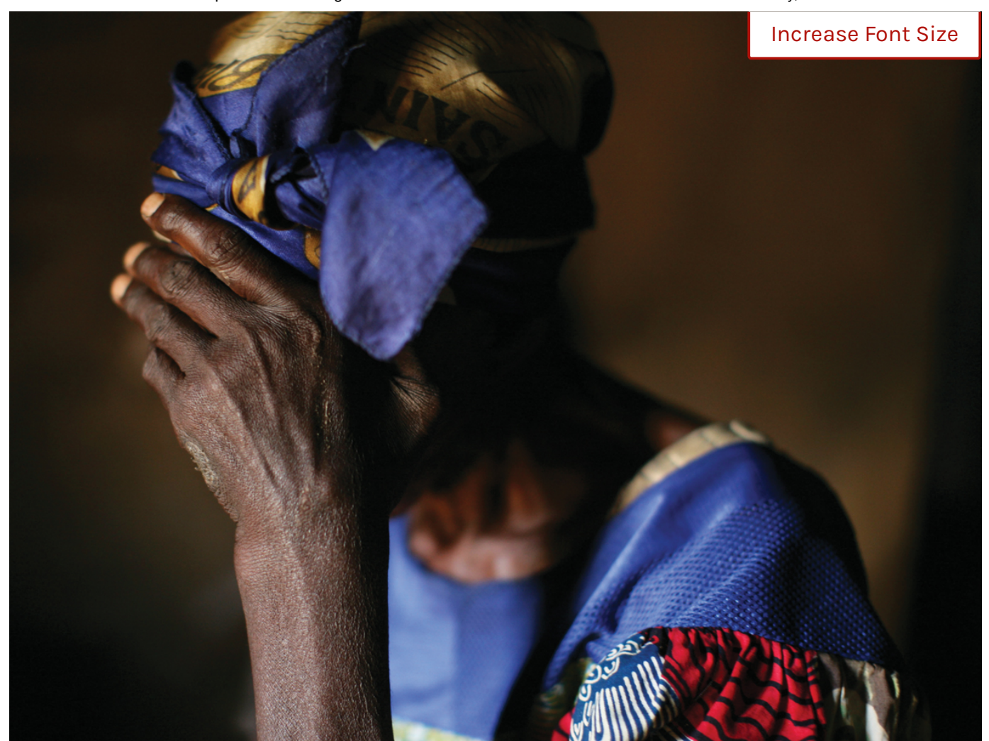
Figure 4.1: Violence against women is a serious and common problem worldwide. Women and children, trafficked for sex and slave labor, are particularly vulnerable in conflict zones. This woman was among hundreds raped when rebels attacked a village in the Democratic Republic of Congo.